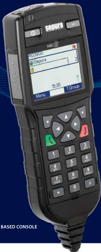
HANDSET BASED CONSOLE