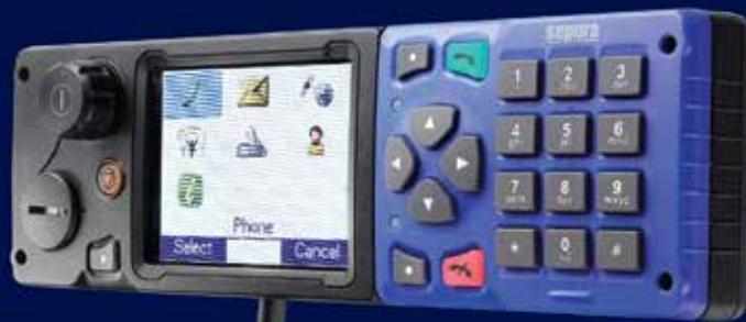
SCC BLUE BEZEL