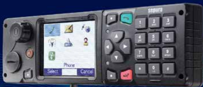
SCC BLACK BEZEL