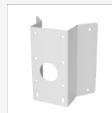
Corner Mount Adapt